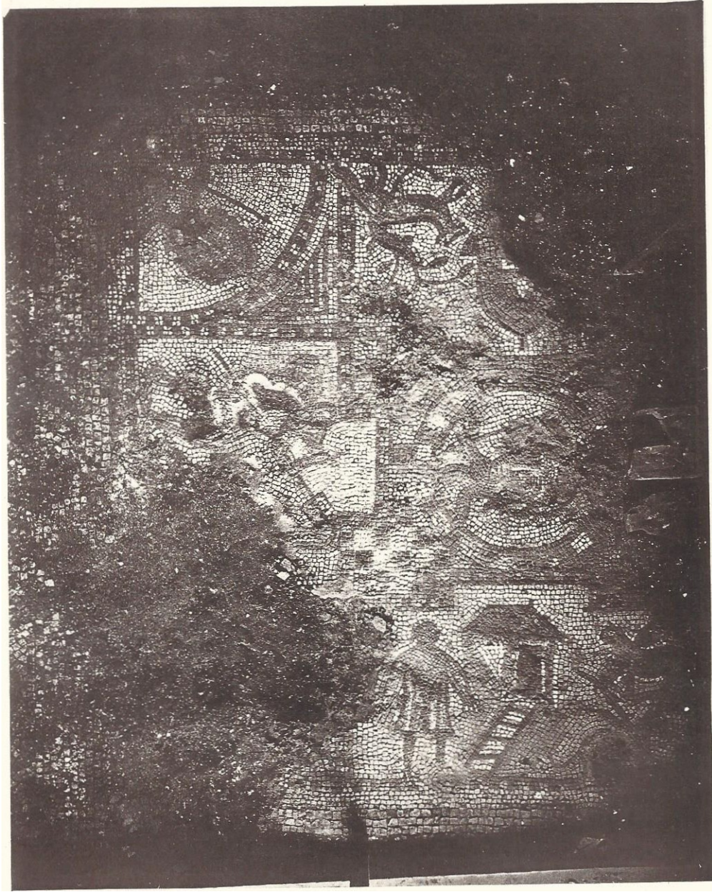
THE ENIGMATICAL GROUP OF THE MAN-COCK.