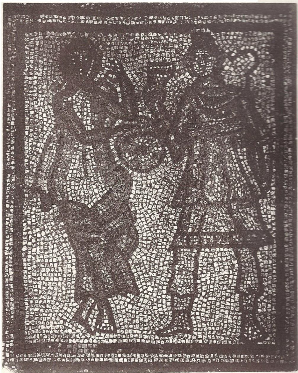
DAPHNIS WITH PANDEAN PIPE AND TERPSICHORE WITH THE TAMBOURINE